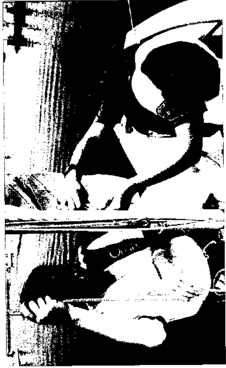
Slides being fitted into luff of slotted mast

Now cast off the tiller lashings and take the mainsheet off its cleat so that the boom can swing. One crewman guides the luff rope into the mast slot; the other takes the main halyard up (after seeing that it is shackled securely to the mainsail headboard ).