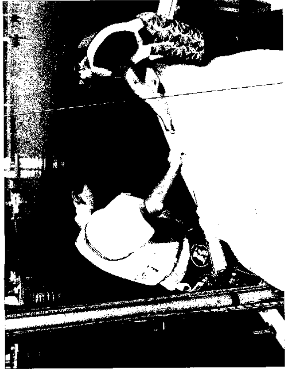
Attaching the sail to the boom