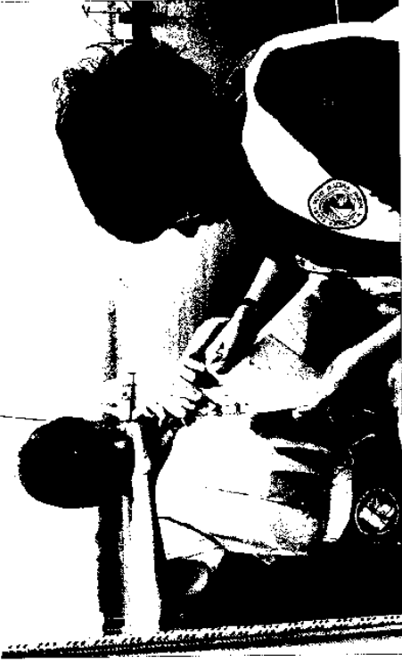
Bending the sails—shackle to headboard

If the sail has battens, slip them into their pockets and secure them with a square knot. If the mainsail has self-closing batten pockets or snap fasteners, use them instead.